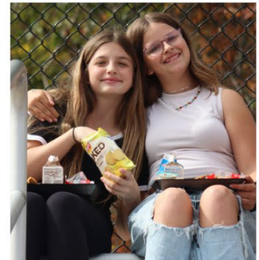
All smiles for the outdoor grill!