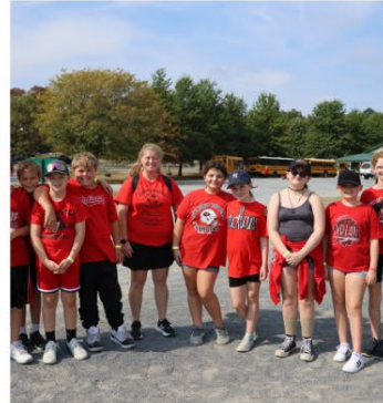
Our sixth graders at Friendship Village.