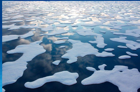
Ice caps melting