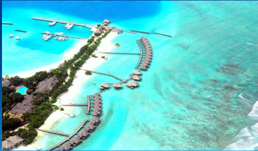
The Maldives island

Many cities and countries such as the Maldives, will disappear because of the seas flooding their countries. They deal with flooding everyday because of sea level rise.